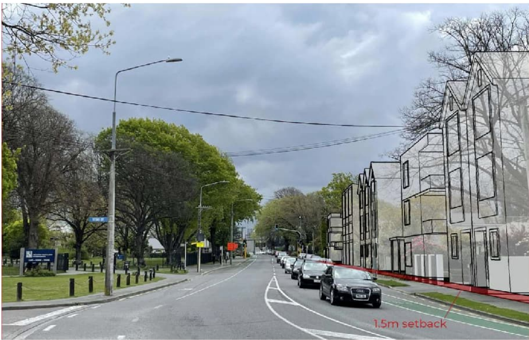
Figure 31 View along Kahu Road looking southeast towards Riccarton Grounds, with graphic overlay showing possible