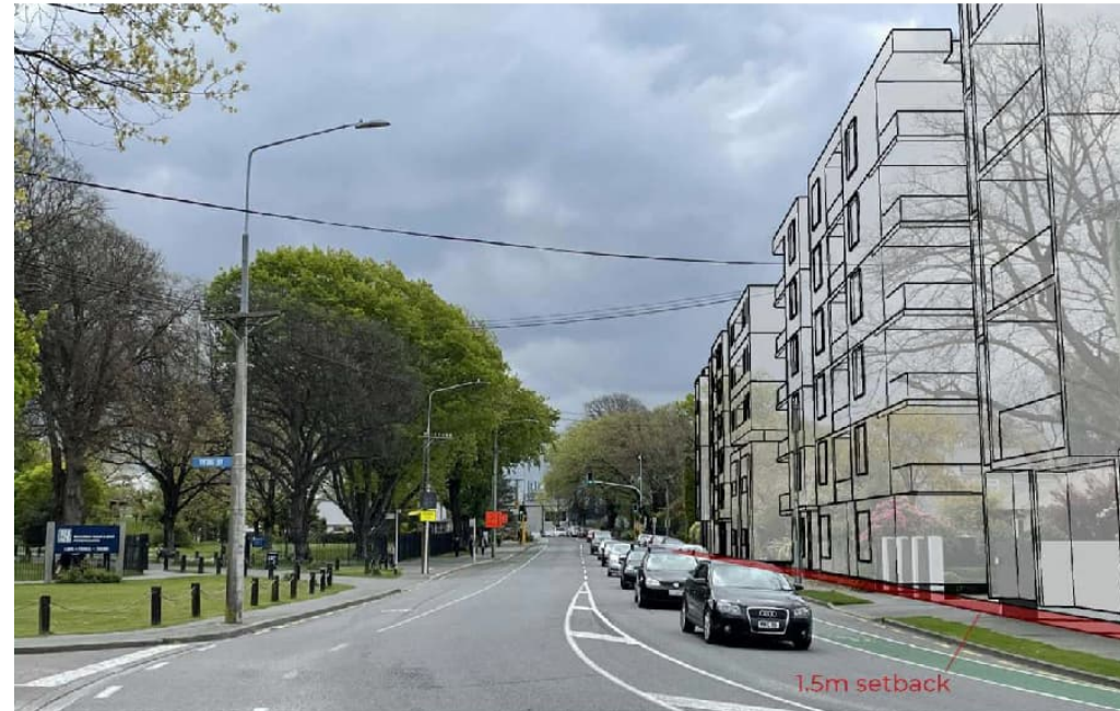
Figure 32: View along Kahu Road looking southeast towards Riccarton Grounds, with graphic overlay showing possible apartment configuration and height limit (20m) under NPS-UD Built Form Standards. Outcome may vary through