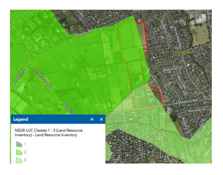
Figure 1 LUC classes on the Site