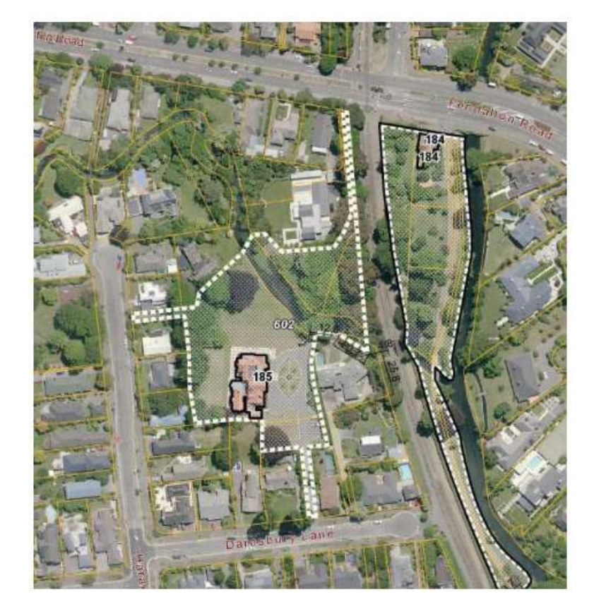
Figure 1. Daresbury House - item #185 and setting #602